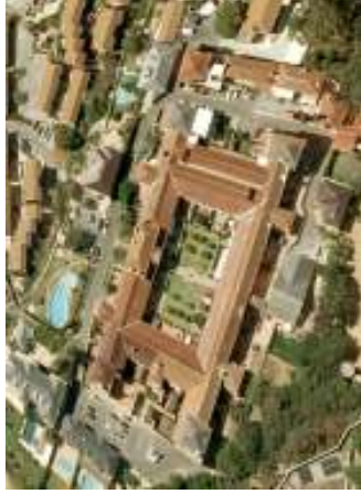
Old Naval Hospital

The second Group Heritage Award was granted to The Old Naval Hospital in recognition of the sensitive way the site has been redeveloped.