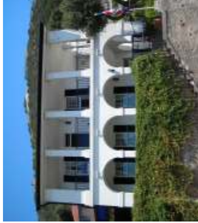
John Snow House