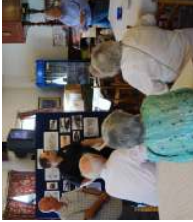
The Group at the visit to the City Fire Station