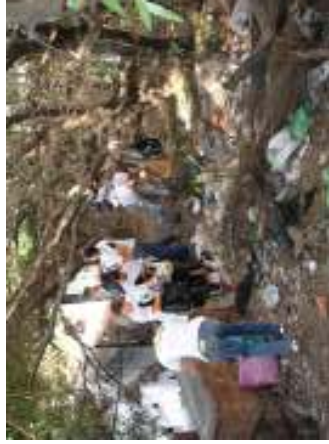
The site before clean up

Cleaning up our city walls: On Sunday 20th September, The Gibraltar Heritage Trust took part in the ESG's Clean Up the World Campaign by conducting a litter pick and rubbish clearance of the section of curtain wall above West Place of Arms (part of North-West Counterguard).