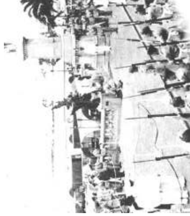
From Illustrated London News , 1945