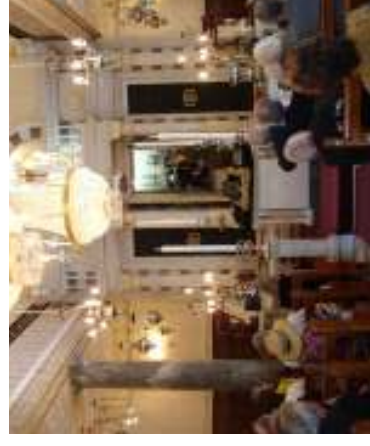
Interior of the Nefusot Yehudah Synagogue