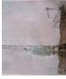
1st Adult's Section