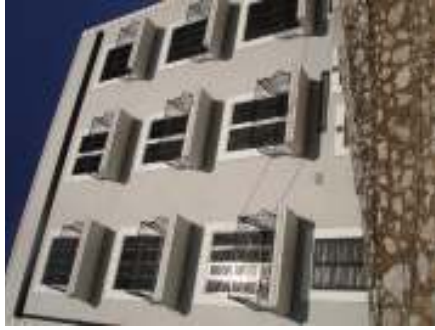
5 Hargrave's Parade

The second Individual Heritage Award was awarded to Wayne Estella for the recovery of 5 Hargrave's Parade an example of Gibraltar's local architecture which has been brought back into use as a home from near-derelict condition.