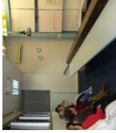
ComCen Tunnels War Plot Room

the Gibraltar Runway. Fighters had been shipped out in crates and assembled on the airfield. Every available cubic foot of storage was taken up with ammunition, fuel and other essential supplies. One hundred and sixty-eight American pilots were housed in the RAF messes at North Front. On 5th November 1942 General Eisenhower joined his staff on the Rock and took over from General Mason-Macfarlane as the Allied commander in Chief Gibraltar. He worked out of what is now known as the Eisenhower Room' in the heart of the ComCen. At his first press conference he said 'Never in my wildest dreams... did I ever think that someday I, an American General, would ever command a Force from the British Fortress of Gibraltar'. The success of operation Torch and the foundations it lay for the eventual allied victory is well recorded in history. Sadly, nothing from the period remains as the original room collapsed on itself many years ago, however the room today functions as a meeting room and is kept as a memorial to the General and WWII.